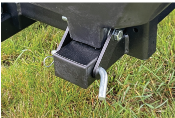
Quick-pin system for Poly Tub & accessories