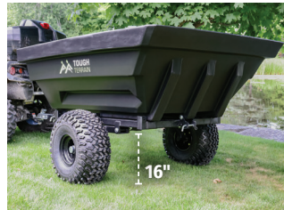
Over 16" ground clearance