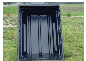
Easy clean out Poly Tub