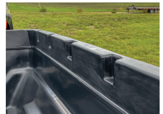
Double wall lip at top for extreme strength